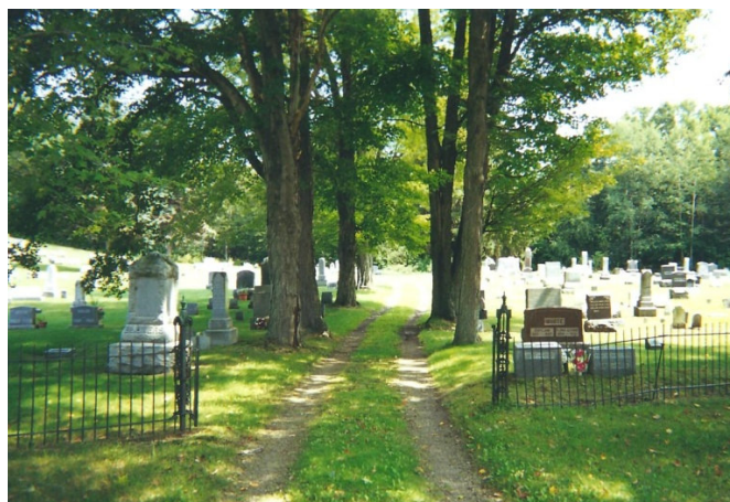
Figure 8. Entrance to Mt. Hope Cemetery, Troupsburg, NY

In spite of his poor health, he remained married and raised his two children, one of which was adopted. He died on 26 October 1919 at the age of 76, and was buried at Mount Hope Cemetery, Troupsburg, NY. In 1920 his pension was transferred to his wife, Margaret. It is interesting that the pension record includes a copy of both his marriage certificate and his death certificate – allowing the location of the grave site to be found. Pictures of the gravesite are seen in Figures 8 and 9.