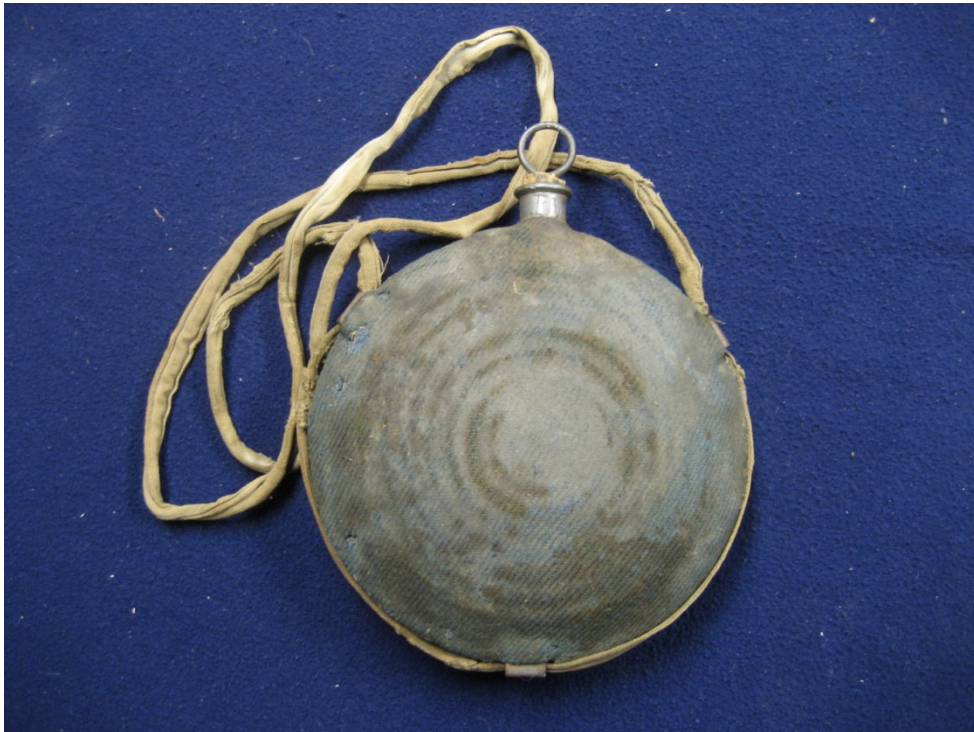
Figure 1. Sgt. White's Civil War "Bull's Eye" Canteen

A soldier could not last very long in the field without food, water, and shelter. During the US Civil War these were essential elements in keeping a soldier healthy and ready to fight. Even so, sickness during the Civil War took more soldiers' lives than did battle and so the Union Army had to provide its troops with the basic necessities. One such necessity was the water-filled canteen. The issue canteen had a very distinctive appearance. Two corrugated tin metal halves were soldered together to form a disk with a soldered-on bottle neck and a cork stopper on top. It was carried by means of white linen strap held on to the circumference of the canteen by three soldered-on metal loops. To prevent loss, the stopper had a metal ring on top with a small metal chain attached to one of the top loops. The canteen was covered with a wool fabric "Union blue" cover to insulate the contents and keep the tin canteen from "clanking" against other accouterments. The stamped corrugated metal gave the sides of the canteen rigidity, and was in the form of concentric rings, giving it the appearance that every marksman knows as the "bull's eye." Even with a canteen, the quality of the water in it mattered too.