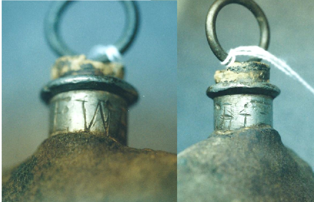
Figure 2. Sgt. White's Name Inscribed on the Canteen Neck

The Union “bull’s eye” canteen with soiled blue wool cover, linen strap, and cork stopper shown in Figure 1 was purchased on 10 Apr 1999 at an antique show in Chantilly, VA. The canteen was from an Ithaca, NY, family estate, and the canteen tin metal neck had the inscription “E.Whit” as shown in Figure 2. The seller explained that the Civil War canteen belonged to a man named “E. White” from either the 86th or 81st New York Regiment. This information was passed on from family descendants of the soldier, along with some other related artifacts, to the seller.